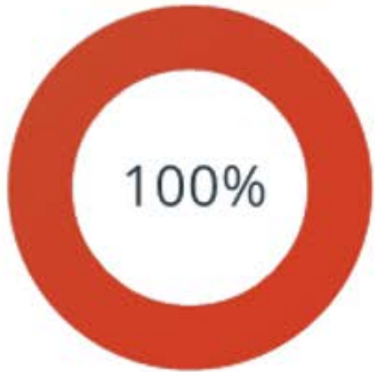
100% Customer Satisfaction