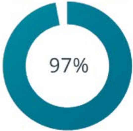
97% Customer Satisfaction