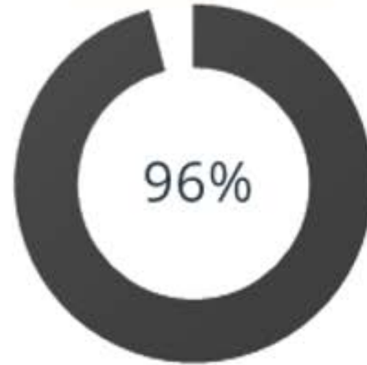
96% Customer Satisfaction