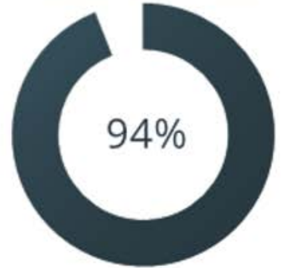
94% Customer Satisfaction