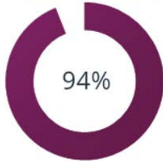
94% Customer Satisfaction