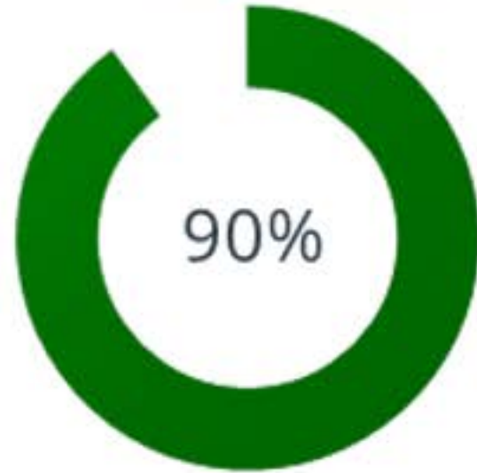
90% Customer Satisfaction