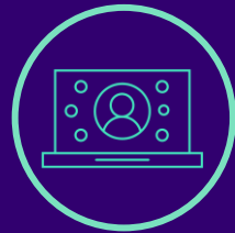
Virtual classroom live